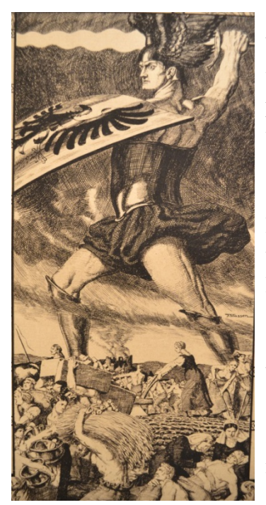
Fig. 3. Artist unknown, 1916. Calendar (detail), published by the Berliner Tageblatt . This image is one of many based on the image of Siegfried, the hero of the Nibelungenlied .

state, provided hopelessly inadequate assistance to heal the bodies and minds of veterans. The "doubtful legitimacy" attached to war trauma (Leed, 2000, p.35) in debates surrounding pension payments further emasculated physically and mentally disabled veterans, as the term became progressively associated with cowardice, and attitudes among the public were, as a result, characteristically ambivalent. To many ex-combatants, this must have seemed like an attempt to obliterate a shameful past, of which they were part. The absence of support, even for war heroes, is encapsulated in images of Iron Cross awardees forced into beggary (Fig. 4). The "real war," states Modris Eksteins (2000), had ceased to exist by 1918; "thereafter it was swallowed by imagination in the guise of memory" (p.297). In Germany's