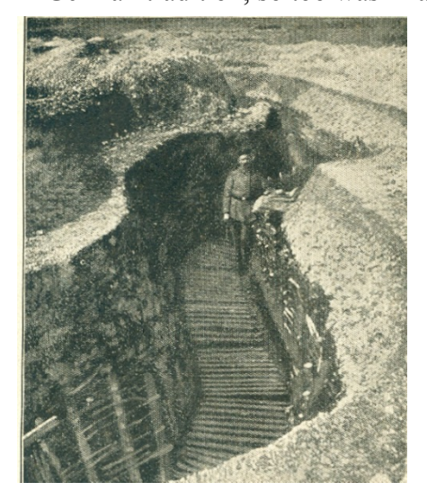
Fig. 8. Unknown photographer, 1916. Trench on the Somme battlefields. In Reichsarchiv: Somme-Nord, 1. Teil: Die Brennpunkte der Schlacht im Juli 1916 [National Archives: Somme-North, Part I: the Focal Points of the Battle in July 1916] (Berlin, 1927). Unpaginated insert.

spiritual healing for the sick. Similarly, Dix acknowledges the suffering of comrades in a landscape ground up with the blood and flesh of soldiers. Dix's use of the triptych format, the inclusion of entombed soldiers in a predella, and the rich, grimly luxuriant transparent glazes recall the tragic splendour of Grünewald's enduring image of agony. A decapitated head crowned with barbed wire (bottom left foreground, central panel), almost invisible in reproductions but almost rolling at the viewer's feet when one stands before the painting, clearly alludes to Christ's crown of thorns and betrays a deliberate attempt to associate the soldier's suffering with Christian sacrifice, sealing this image's societal function: that of defending and justifying the recollections of German veterans, and acknowledging their suffering.<sup>12</sup> Recourse to Grünewald's enduring image of agony within the context of the martyred soldier was hardly accidental. As much as heroic imagery of soldierhood was bound in German tradition, so too was imagery of the crucified Christ. The multi-panelled altarpiece