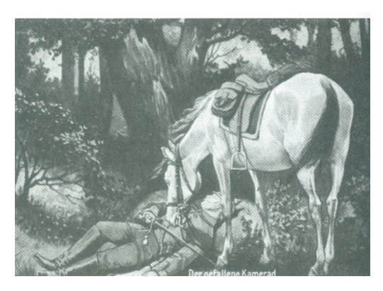
Fig. 2. Artist unknown, 1918. Der gefallen Kamerad [The Fallen Comrade]. This postcard is typical of so-called mythmaking images. The dead soldier, head resting on a stone, is shown without wounds, accompanied by his faithful horse.

establishment of the myth of the war experience, as George Mosse termed it, gained a lasting resonance with those too young to fight in World War I (ibid, p.7). Idealising imagery helped counter the indigestible reality of industrialized warfare, promoting war as glorious and justified (Figs. 1-2), while recourse to age-old heroic imagery became increasingly prevalent and reinforced (Fig. 3). Instances of such material gradually increased throughout the 1920s and were distributed widely in publications such as the lavishly illustrated Reichsarchiv series and periodicals such as Simplicissimus . Concurrent with the promotion of myth-making imagery, the German government – while pioneering in the establishment of a welfare