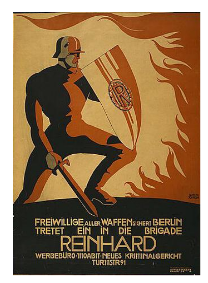
Fig. 1. Helmuth Stockmann, 1919. Volunteers with all weapons will secure Berlin. Enlist in the Reinhard Brigade. Lithograph, 94 x 71 cm. Washington: American Library of Congress.

Found guilty of causing World War I, Germany's nascent democratic government grappled with crippling reparations, social and economic upheaval, and the restoration of national pride. Such conditions, which plagued the Weimar government throughout its tenure, urged a reassessment of the cost of the war to the health and economy of the nation (Willett, 1996). The government and army, reticent in acknowledging defeat and attempting to assign blame to homefront dissidence for the loss of the war through the so-called 'stab-in-the-back' theory, continued to promote an excessively militant brand of patriotism, accompanied by idealized literary and visual accounts of soldierhood (Mosse, 1990, pp.7-50). While there were attempts in all the belligerent nations, through literary and visual means, to justify the loss of so many young men, the prevalence of heroic imagery in Germany was particularly marked. Weimar politics retained a high respect for, and glorification of, the military, and as the war itself became more distant, the